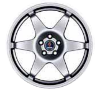
6-spoke 18x8" alloy wheel. (Saab 9-3 / 9-5)