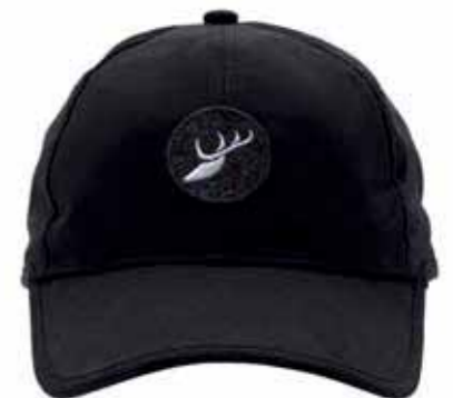
Cap High quality cap made of microfibre with a Hirsch Performance badge at the front. Adjustable velcro back strap.