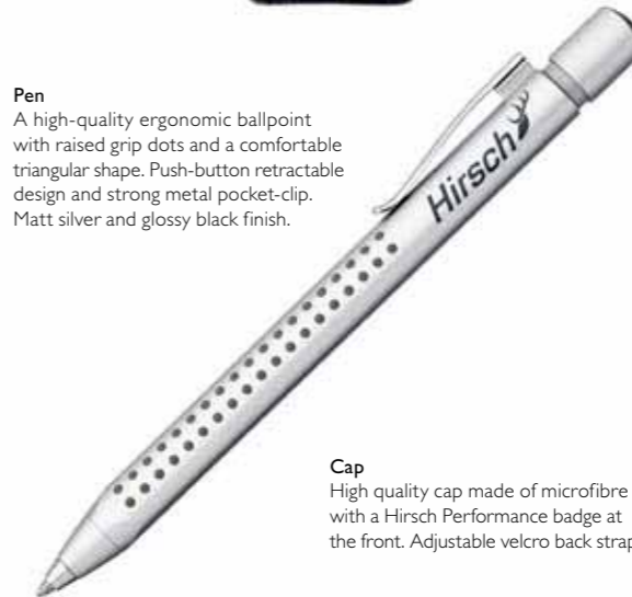
Pen A high-quality ergonomic ballpoint with raised grip dots and a comfortable triangular shape. Push-button retractable design and strong metal pocket-clip. Matt silver and glossy black finish.