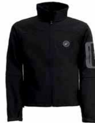
Jacket Classic-fitting performance jacket in water-resistant and breathable stretch softshell. Pocket on left arm, two "hidden" zip pockets and waist drawstring. Hirsch Performance badge at the chest and Hirsch Performance reflective print on the arm.