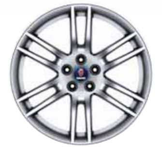
6-Twin spoke 19x8" alloy wheel. (Saab 9-3)