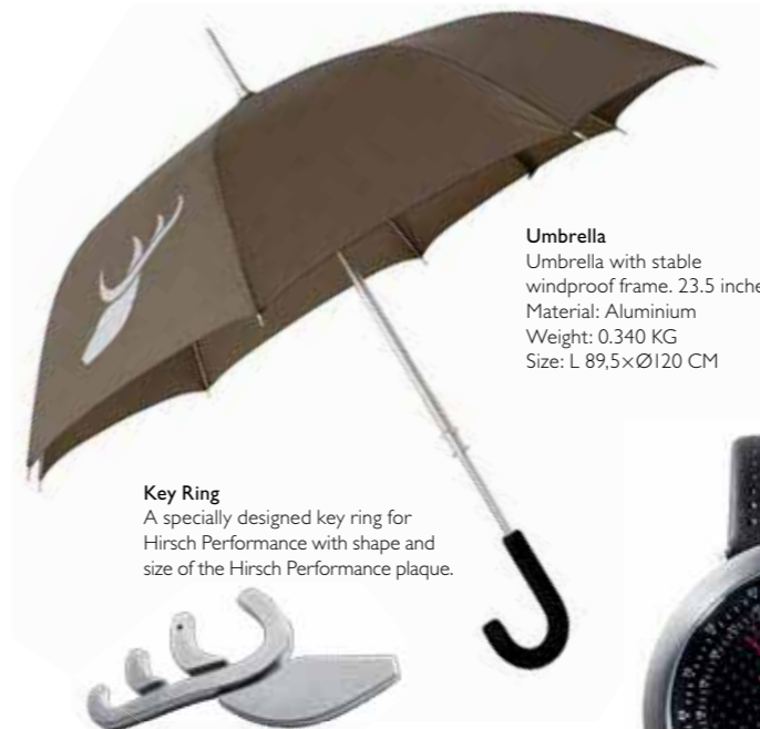
Umbrella Umbrella with stable windproof frame. 23.5 inches. Material: Aluminium Weight: 0.340 KG Size: L 89,5xØ120 CM