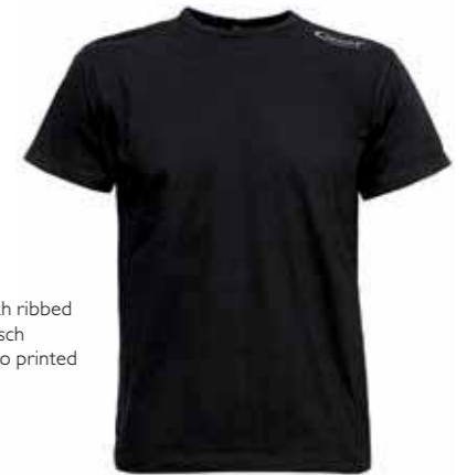
T-shirt Men's T-shirt with ribbed neckline and Hirsch Performance logo printed on the shoulder.