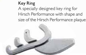
Key Ring A specially designed key ring for Hirsch Performance with shape and size of the Hirsch Performance plaque.