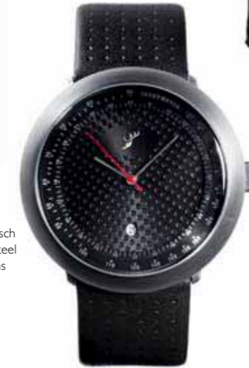
Watch A specially designed watch for Hirsch Performance with solid stainless steel case, leather strap, date functions and 10 ATM water resistance.