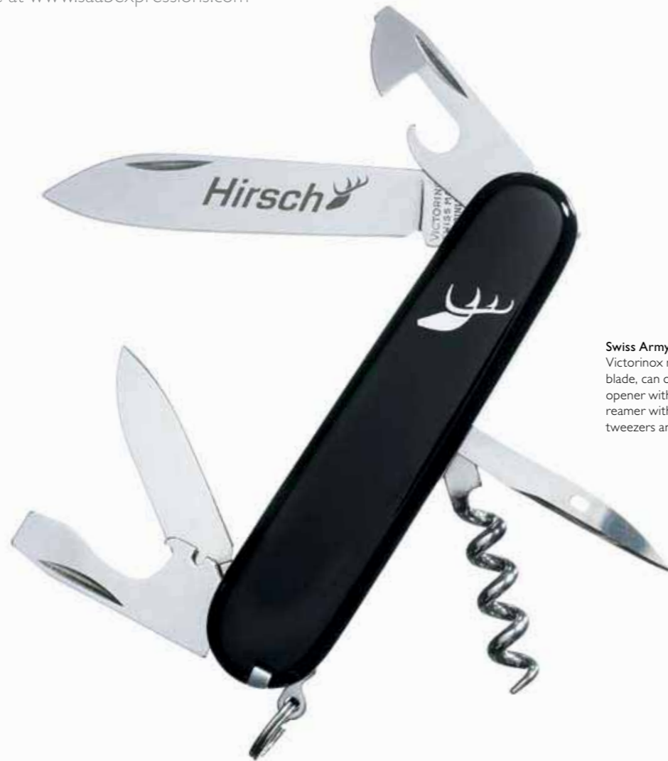
Swiss Army knife Victorinox multi-tool with large blade, small blade, can opener with small screwdriver, bottle opener with large screwdriver & wire stripper, reamer with sewing eye, corkscrew, toothpick, tweezers and key ring.

Attention to detail is at the heart of what we do at Hirsch Performance. The quality of the smallest part often determines how well a system functions and how it is perceived. Likewise, a small but elegant accessory can have great impact on overall appearance. Hirsch Performance Expressions is a range of high-quality products specifically designed to accentuate your lifestyle and reflect the values of the Hirsch Performance Saab you drive. You are warmly welcome to explore our entire range at www.saabexpressions.com