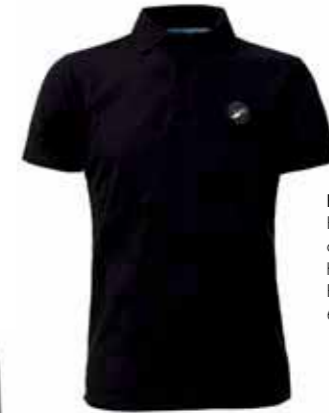
Polo Shirt High-quality polo shirt made of a coolmax material that helps the body stay cool. Hirsch Performance badge on the chest. 60% cotton/40% coolmax.