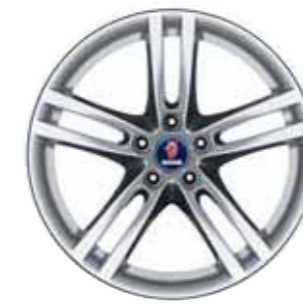
5-Twin spoke 18x8" alloy wheel. (Saab 9-3 / 9-5)