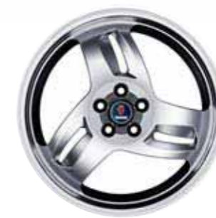
3-Twin spoke 19x8" alloy wheel. (Saab 9-3)